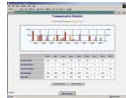
Mobile Unit Specific Statistics