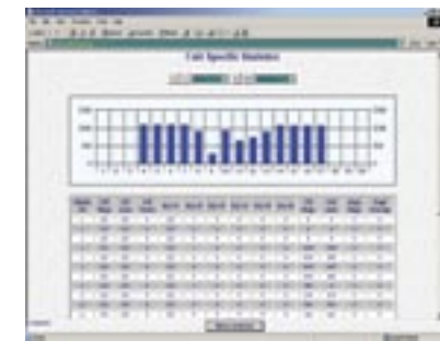
Real-time Transaction screen